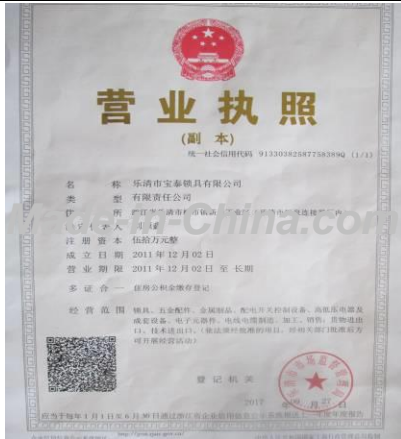
Description: Business License