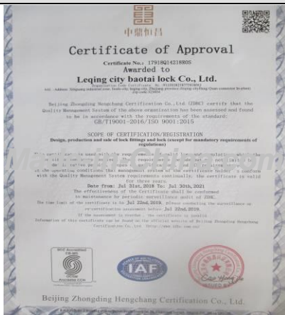
Description: ISO9001 Certificate